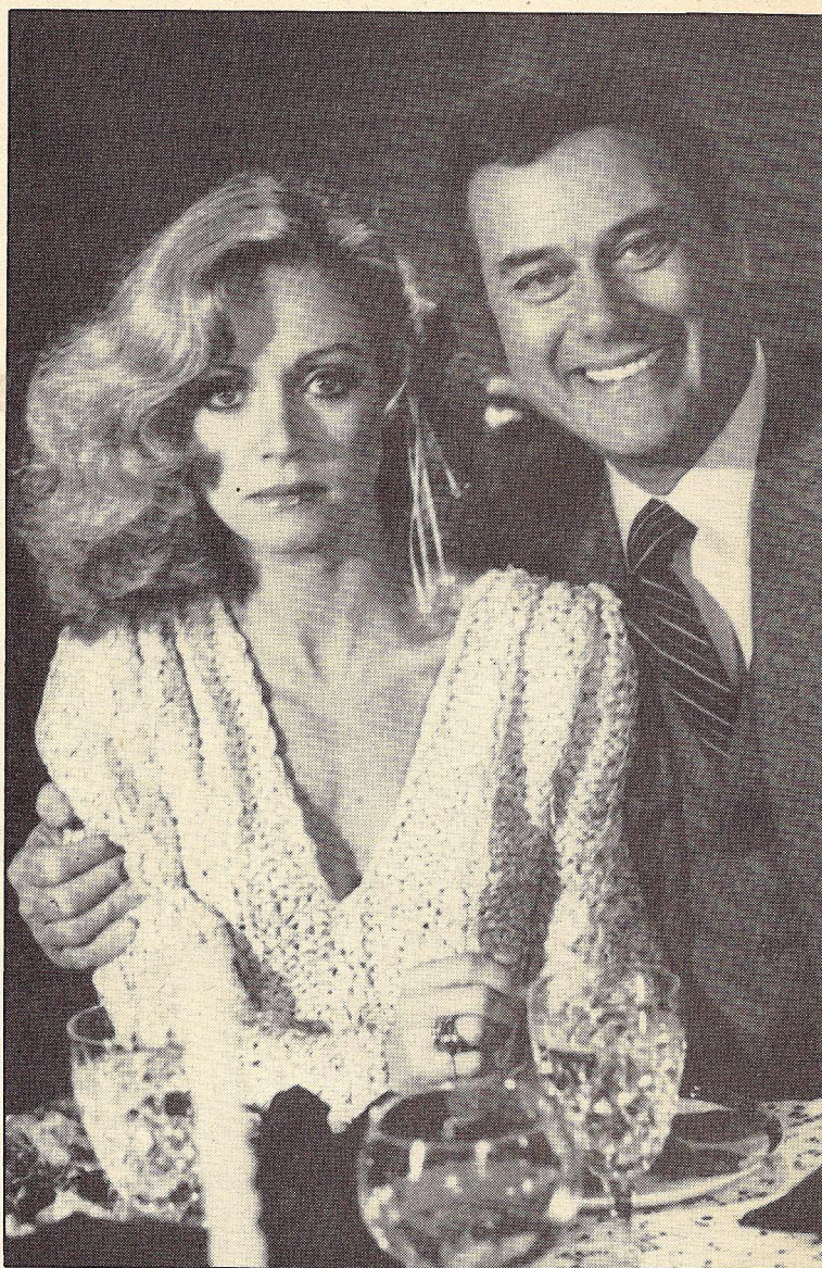
J.R. (Larry Hagman) comes to ( Knots Landing and strikes up ▲ a business deal with Abby (Donna Mills).

The transplanted mid-westerner, Donna Mills, "loves to dress up" but finds it difficult to do on the west coast. "The weather is so hot all