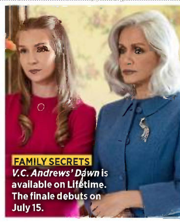
FAMILY SECRETS V.C. Andrews' Dawn is available on Lifetime. The finale debuts on July 15.