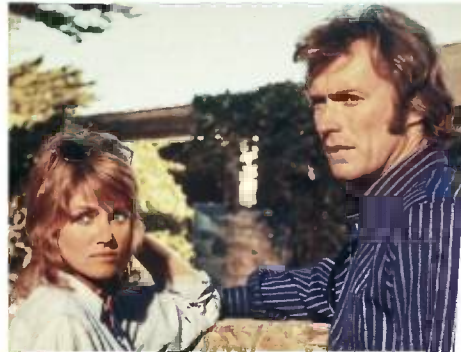
BAD ROMANCE She played the former girlfriend of Clint Eastwood's DJ character in 1971's Play Misty For Me .