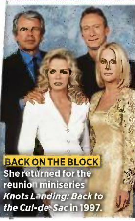
BACK ON THE BLOCK She returned for the reunion miniseries Knots Landing: Back to the Cul-de-Sac in 1997.