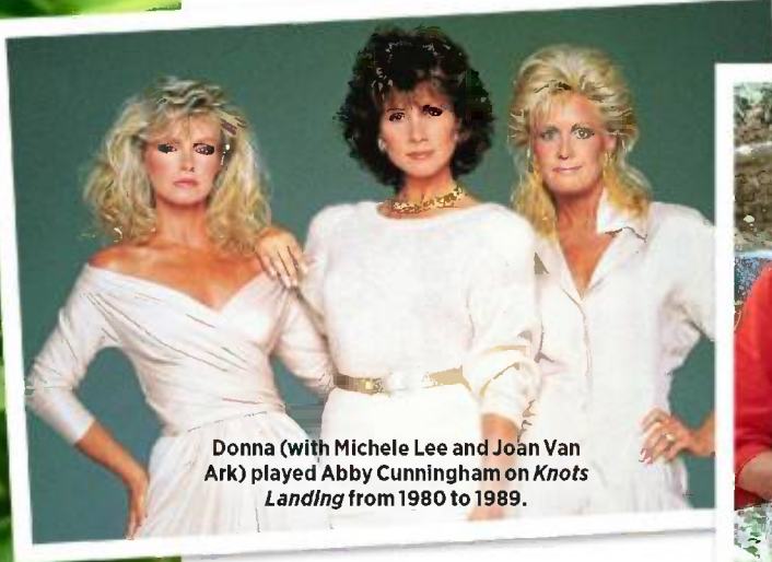
Donna (with Michele Lee and Joan Van Ark) played Abby Cunningham on Knots Landing from 1980 to 1989.